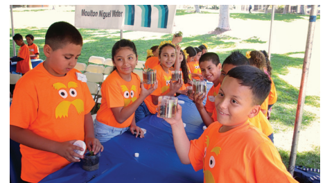
Students showing off their water cycle projects at MNWD’s booth at the OC Children’s Water Education Festival in March.